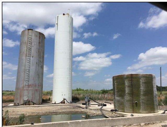
Photo 4. Standpipes with Ground Tank at right