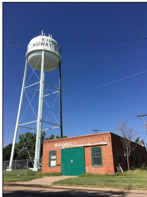
Figure 2. Elevated, Double-Ellipsoidal Tower