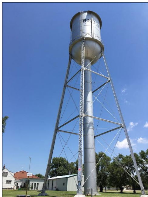
Figure 1. Elevated, Tin-Can/Traditional Tower