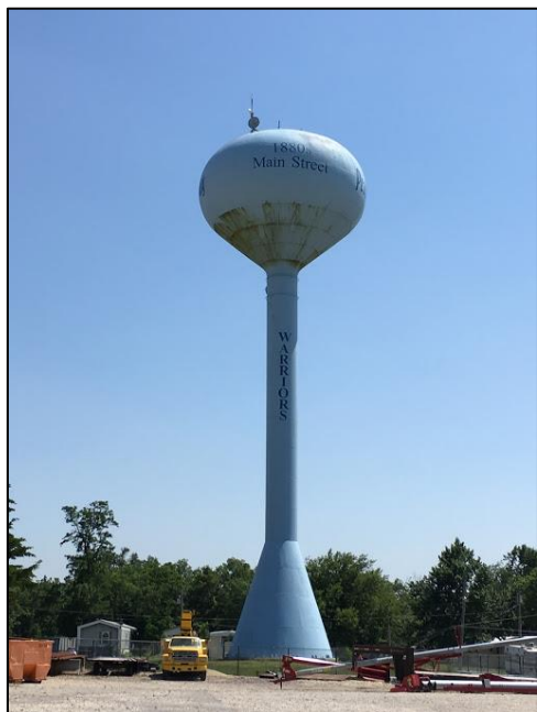
Figure 3. Elevated, Spheroid/Balloon