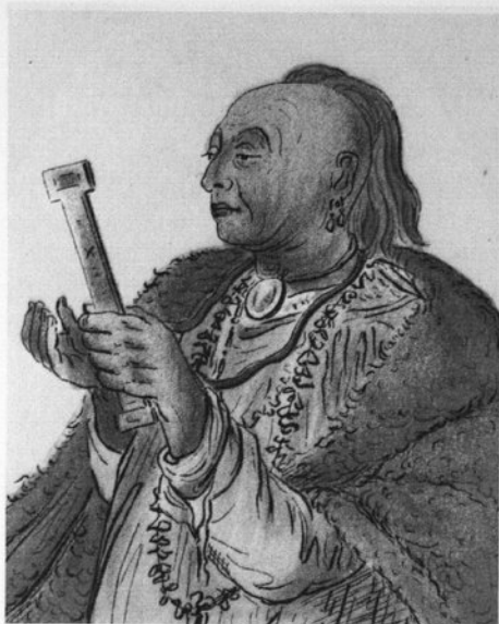
This disciple of the prophet is holding a prayer stick, distinctive feature of Kennekuk's religion. George Catlin, famous artist of Indian life who painted this picture, described the prayer stick which was carved with a number of characters resembling Chinese letters. As the followers placed their fingers on the characters, much as Roman Catholics use prayer beads, they chanted or sang a sentence or two which the characters suggested.

Kishko and Kennekuk established two separate communities in the new reservation. Kishko's band lived by hunting and trade and were contemptuous of Kennekuk's followers who quickly settled down to an agricultural existence and a friendly attitude toward the United States government. The treaty of Castor Hill provided special benefits for agricultural pursuits. Kennekuk's band became the chief