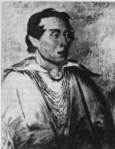
Kennekuk (ca. 1785-1853), the Kickapoo prophet who at the height of his career claimed about 400 Kickapoo and 100 Pottawatomie followers, preached an interesting amalgam of Indian and Christian religious precepts. Missionaries and others beat a path to the Kickapoo reservation west of Fort Leavenworth to see this "Indian Mahomet," the missionaries coming with the hope of enticing Kennekuk into their fold and thus adding his followers to their church rolls.

influence his tribesmen to move. On the other he argued against moving at all. The Great Father in Washington had long insisted that the white man's civilization was the only salvation for the Indians. Kennekuk's band had adopted this civilization, so why should they move.