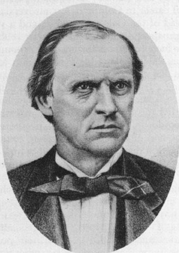
Gov. George T. Anthony (1824-1896), fearing riots similar to the ones at Pittsburgh, Pa., the previous year, called out the state militia to bolster local officials and make a show of force. The troops were received quietly at the state capital, but there was great anger among Emporia citizens. When a militiaman accidentally shot and killed a town minister, Emporia's rage found sympathy statewide and helped make Anthony the first Kansas governor since the Civil War to fail to win two terms in the statehouse. Photograph reproduced from Portrait and Biographical Record of Southeastern Kansas (Chicago: Biographical Publishing Co., 1894).