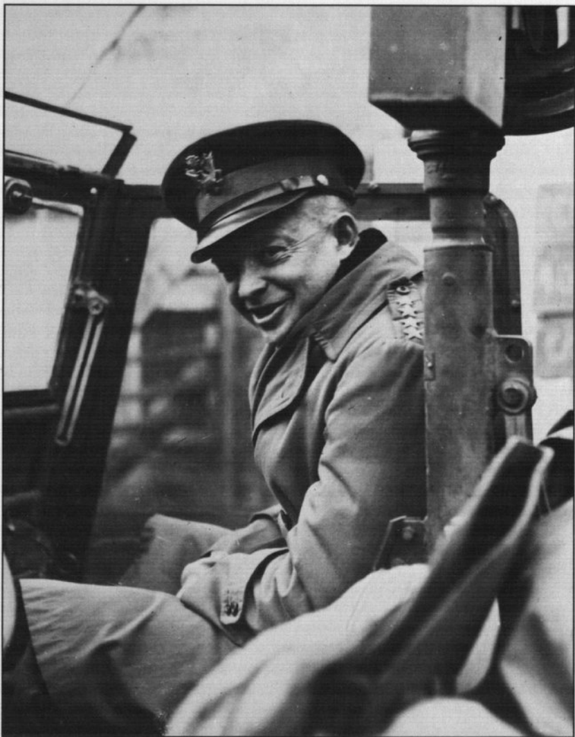
Eisenhower as Supreme Allied Commander, 1944.

Cover and back cover: Greeted in 1945 as America's national hero, Dwight D. Eisenhower was elected President of the United States in 1952. On the cover is a portrait photograph of Eisenhower as President; on the back cover is a scene from Ike's whistle-stop victory tour following the end of World War II in Europe—the scene, repeated all along Ike's route, was photographed in Topeka, Kansas, in June 1945. This issue of Kansas History recognizes the Eisenhower Centennial celebration of 1990 with a series of articles devoted to the man who called Abilene, Kansas, his hometown.