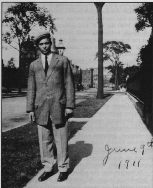
Two years after his short speech, "The Student in Politics," Dwight D. Eisenhower was on his way to West Point; over forty years later, that speech would resurface when Eisenhower became Republican nominee for President.