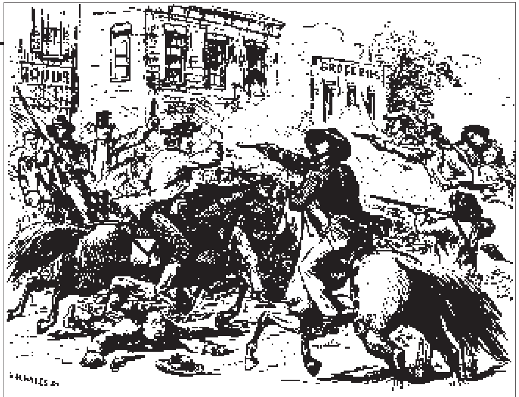
Guns were among the most important tools used in territorial Kansas. Although violence was not nearly as prevalent during these years as embellished reports and illustrations such as this indicate, guns carried a special symbolic meaning in the turmoil of Bleeding Kansas.

Much has been made of the New England Emigrant Aid Company as a supplier of firearms, especially Sharps rifles or carbines, to the free-state settlers of Kansas. The truth is that the company, as a company , did not give or sell arms to anyone. 9 Some of the directors of the company, as individuals , did give or lend guns to antislavery emigrants, but the company could not become involved in such activity without alienating the significant portion of its supporters who were pacifists to a greater or lesser de-