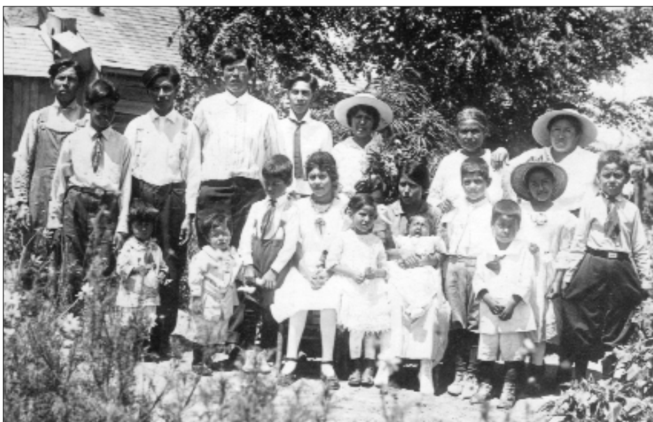
Hispanics, constituting the fastest growing minority in the nation, had become visible in Kansas by the 1930s. Coming primarily from poor and illiterate communities in Mexico, most immigrants found work in the sugar beet fields in western Kansas or along major railroad lines in Wichita, Topeka, and Kansas City. Pictured above are Hispanic residents of Garden City, ca. 1930.

Scholars have approached the study of Hispanic Kansans with the same paradigm of “assimilation versus acculturation” employed in Native American history. The migratory nature of their work and geographical proximity to Mexico meant that for many, relocation to the United States was not the traumatic cultural uprooting it was for European immigrants. Non-Hispanics often charge them with “ethnic clannishness,” raising questions about the extent that prejudice played in their lives. Larger cities such as Topeka excluded Mexican children from both private and public schools, whereas in smaller towns such as Hutchison and Garden City, an informal segregation system existed in theatres and restaurants. The most blatant examples of discrimination occurred in the workplace. Although Mexicans and Anglos worked side by side and received the same pay in railroad construction and beet picking, Mexicans