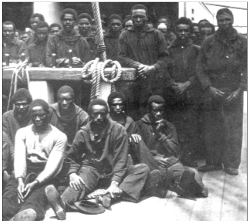
Montgomery lobbied abolitionists, war department officials, congressmen, and President Lincoln seeking command of a black regiment. Early in 1863 he received permission to raise a new unit among runaway slaves who had taken refuge behind Union army lines. Contrabands such as these composed Montgomery's Second South Carolina Infantry.

Did social, cultural, and political confusion create the violence that became endemic to Bleeding Kansas? In most other frontier settings, the answer surely would be yes. It is nearly axiomatic that territories lacking basic legal and political structures encourage the sort of confusion and displacement that creates violence. Kansas had its share of this sort of thing.