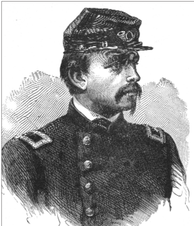
Of James Montgomery, Colonel Robert Gould Shaw (above) wrote in 1863, "I can't help feeling a great respect for him. He is quiet, gentlemanly, full of determination, but convinced that the South should be devastated with fire and sword."

cation to the Union cause and thinly veiled racism. Shaw's alarm grows when Montgomery pays him a backhanded compliment concerning the Fifty-fourth's marching prowess. "I am surprised by how well you handle 'em," drawls Montgomery. "See, I am from Kentucky originally, and we owned a few ourselves, so it comes naturally to me." Glory also depicts the foraging expedition into the town of Darien, Georgia, as a dirty little atrocity, with Montgomery as the instigator of violence directed toward suspected Confederate sympathizers and even his own soldiers, one of whom he shoots for assaulting a white woman. When Shaw tries to resist Montgomery's order to fire the town, the jayhawker with a peculiar gleam in his eye intones, "you see, secesh has got to be swept away by the hand of God, like the Jews of old. And now I shall have to burn this town." 1