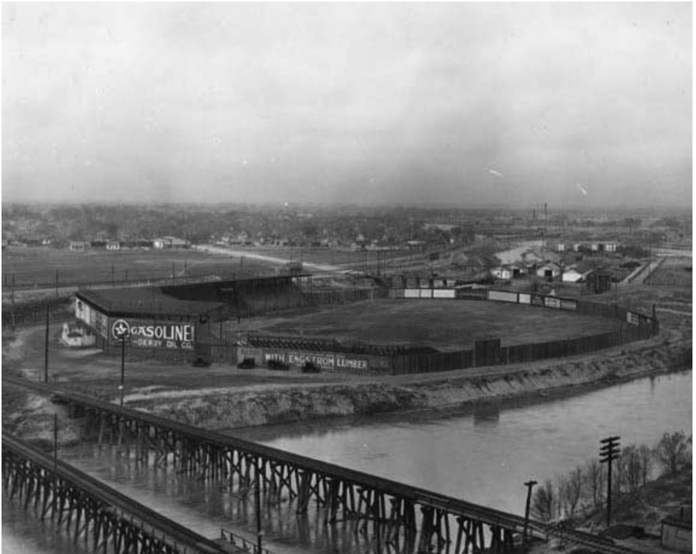
Island Park, Wichita, Kansas, 1925.