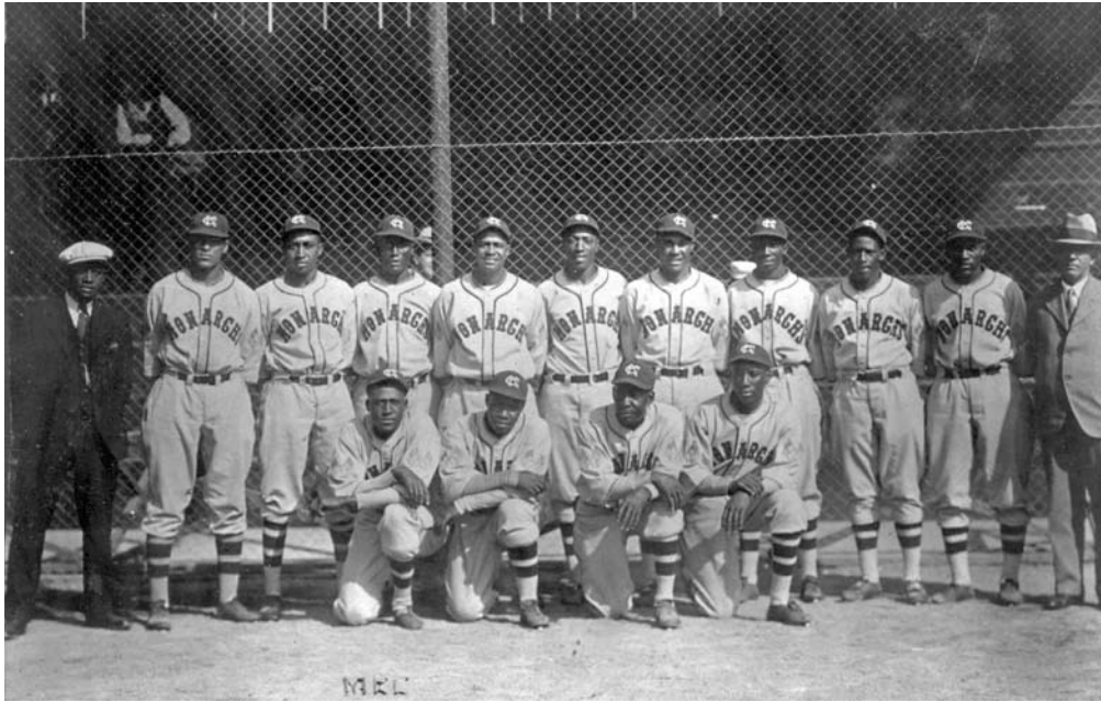
Demonstrating the importance of baseball to the local black community, the hugely successful Kansas City Monarchs were described as “the life of Kansas City in the Negro vicinity.” The Monarchs, led by one of sport’s most accomplished players, Leroy “Satchel” Paige, and press coverage of the team wherever it barnstormed, contributed as much to the integration of baseball in Kansas as any other single factor. As if following a Hollywood script, the 1934 Monarchs, pictured here, lost the final game of the Denver Post Tournament to the House of David, a Benton Harbor, Michigan, barnstorming team that had hired Satchel Paige as a ringer just for the semi-pro tournament. Paige pitched the “Bearded Beauties” to a 2 to 1 win over his old team to take the $6,500 prize.

change. This silence says a great deal about race relations in the city at the time, when society remained largely indifferent towards race, and when integration on its playing fields simultaneously occurred in at least two ways. First, two Mexican teams were allowed to play in Wichita’s amateur leagues for the first time—the Midgets, also called the Mexicans, in the Junior League, and the Aztecs in the very competitive Commercial League. It is unknown why the Mexican teams were allowed or whether anyone noticed or cared about the teams’ racial composition. Few game results for either team appeared in the Eagle or the Beacon , and no mention is made of the teams’ race or of the social momentousness of the first non-white teams’ entry into the city’s leagues. 13 Unlike Wichita’s African American community, the city’s Mexican community did not have its own newspaper.