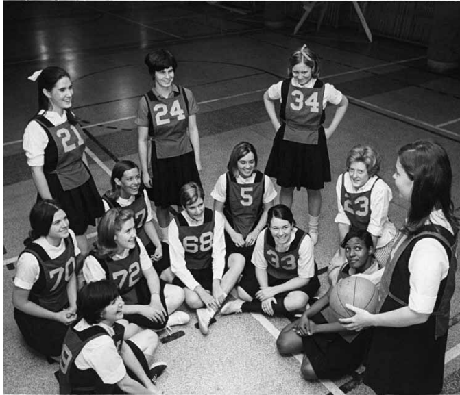
At Summit Country Day School, which she attended from kindergarten through twelfth grade, Kathleen Gilligan (number “21” on the left) was a “jock.” She competed in the team sports of soccer, field hockey, and basketball—the latter still used “the old girl’s rules, which was really the stupidest game on the face of the planet.”

school from kindergarten through my senior year in high school: the Summit Country Day School, a Catholic private school. I think there’s no doubt that going to an all-girls school shaped me in very positive ways, because I was raised in an era where girls had definite limitations. If you were a girl past the seventh grade, the sports basically stopped for girls. You could be elected treasurer of the class, but you were unlikely to be president. I had friends who if they raised their hand too often in math class learned the hard way that they weren’t going to be invited to the parties over the weekends, so they had to pick and choose. But I never was in that world. My world was girls did everything. We had the smartest in the class, and we had the dumbest in the class. We had the jocks and the ballerinas. We had the presidents and the dunces. My world was wide open. Nobody ever told me that girls couldn’t do everything because I lived in a world where they did. I think that had an indelible etching on me growing up in the 1950s.