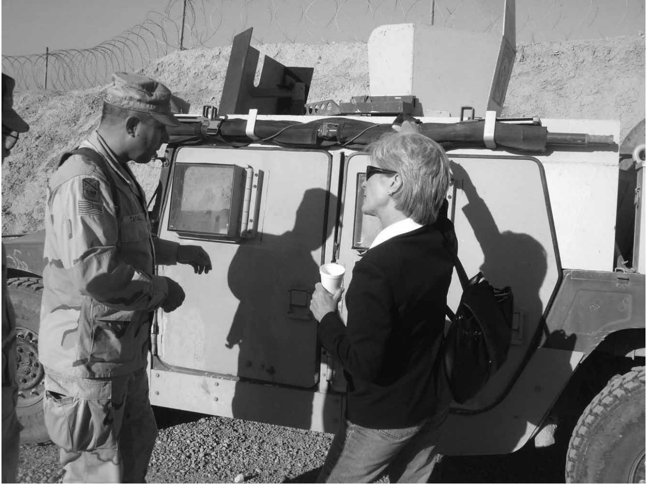
In November 2005, Governor Sebelius visited Kansas National Guard troops in Iraq and Kuwait where she enjoyed two Thanksgiving dinners—one with the 891st Engineering Unit, which was based in Kansas. She traveled to the Middle East as part of a small delegation of governors sponsored by the U.S. Department of Defense. The others were Haley Barbour of Mississippi, Jennifer Granholm of Michigan, and Sonny Perdue of Georgia.