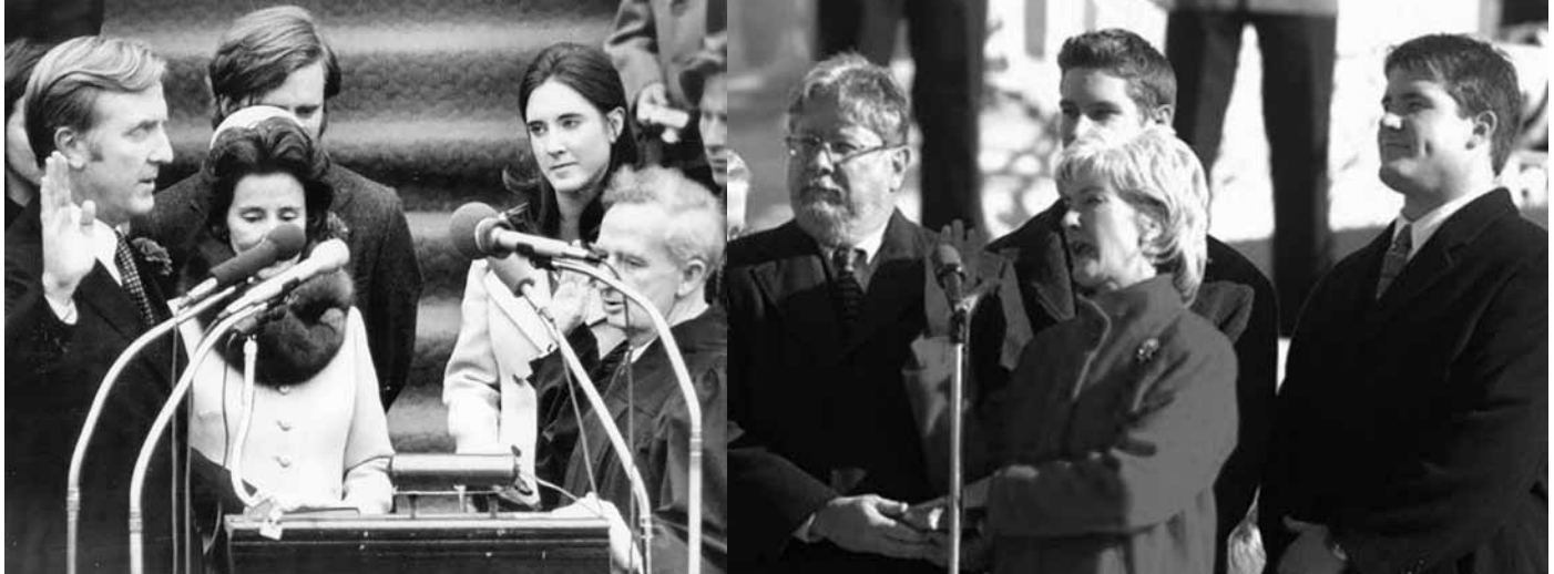
On January 11, 1971, Kathleen Gilligan looked on as her father was sworn in as the sixty-second governor of Ohio. A Democrat, Governor Gilligan lost his bid for reelection in 1974, but he taught his oldest daughter “that it’s important to have a moral compass. It’s important to have courage enough to take a stand on issues that are serious and defining,” explained Sebelius. “And even if you lose, it’s not the end of the world.” Almost thirty years later, when she took the oath and assumed the Kansas governorship, Governor Sebelius (pictured here with her husband and two sons in January 2003) and former Governor Gilligan became the only father and daughter ever elected as governors.

activity in our family—it was sort of mandatory. We went door-to-door and put up yard signs. I thought that’s what everybody did in the fall, and it only came to me later in life that there were people who actually went out to picnics and went to football games and didn’t spend their time in call rooms and phone banks! From a very early age, we were around my father’s campaigns, so there was a lot of full-contact sport in our family. That actually turned out to be very lucky for me because when I began to run for office, you could bring my siblings in, drop them at any vicinity in the state, any room at any place, and they could run a call bank, they could go door-to-door; I had these wonderfully trained and skilled volunteers. Other people had to go hire people—I just called my family.