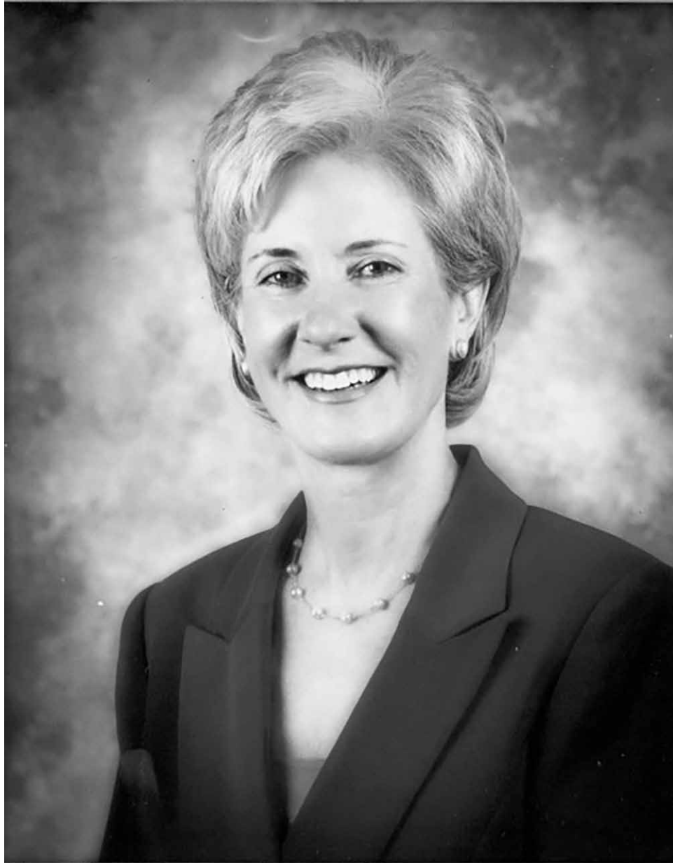
Kathleen Sebelius, governor of Kansas, 2003-2009.