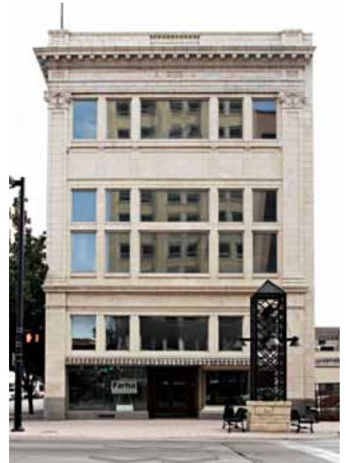
Left to right, University of Kansas Historic District, Douglas County; Woolf Brothers Clothing Company Building, Sedgwick County.