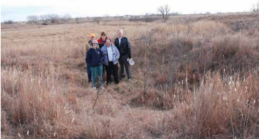
Representatives of the Kansas Historical Society, Ellis County Historical Society, and Kansas Anthropological Association stand in a dugout depression at 14EL311 during a December 2012 reconnaissance.