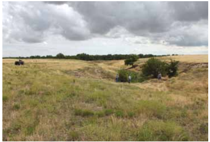
Clockwise, Boot Hill Museum, Ford County; Santa Fe Trail – Ford County Segment 2, Ford County; Dodge City Municipal Building, Ford County.

American popular culture—as the stereotypical Wild West town. While the protagonists of dime novels, movies, and television series like Guns, Smoke & Matt Dillon were telling bad guys to “get the heck out of Dodge,” tourists flocked to the legendary town. By the mid-20th century the city’s efforts to live down its rowdy past were overwhelmed by the potential for capitalizing on it. Locals had been advocating for a Boot Hill museum as early as the 1920s, but it wasn’t until after the 1939 world premiere of the movie Dodge City , which firmly placed the town within the popular culture lexicon, that the city commission issued bonds to begin construction. The site developed in stages and was largely complete by 1964. Boot Hill Museum is nominated as part of the Roadside Kansas multiple property nomination for its significance in the areas of entertainment and education as a mid-20th century museum that interprets Dodge City’s history as a cowtown and for its association with the local tourism industry.