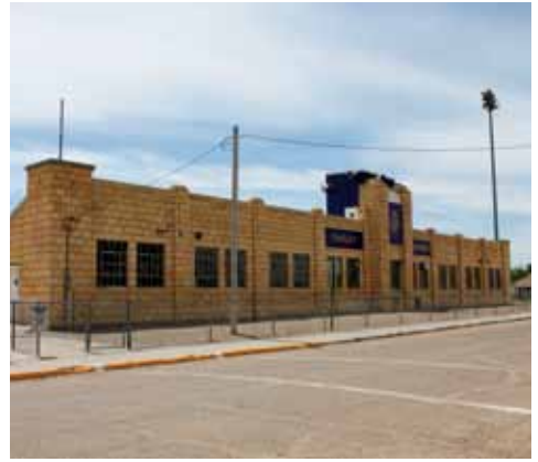
Left to right, Fourth National Bank Building, Sedgwick County; Kibbee Farmstead, Douglas County; Oakley High School Stadium, Logan County.