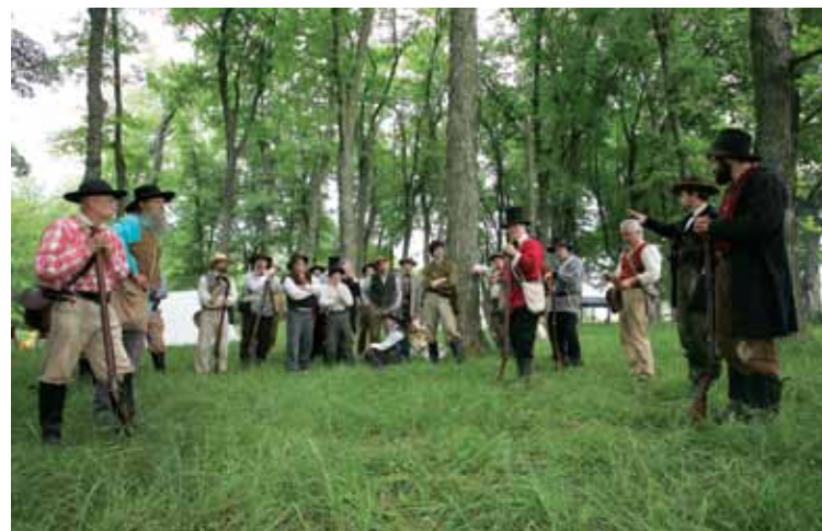
Reenactors gather at Black Jack Battlefield to remember the event in 2010.

It becomes the third NHL in Douglas County — Haskell Institute in Lawrence and Lecompton’s Constitution Hall also are designated — and just the 25th NHL in Kansas. To read more about Kansas’ landmarks, visit kshs.org/15743 .