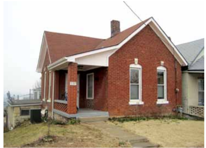
Left to right, 431 Armstrong; 537 Thompson Street

in the Strawberry Hill area. The 1869 bird's-eye view of the city shows only about fifty dwellings on the Hill clustered primarily along Armstrong and Ann avenues. Among those shown are the extant homes at 431 Armstrong Avenue and 403 Barnett Avenue. By 1873 developers began filing plats to expand and reorganize the city.