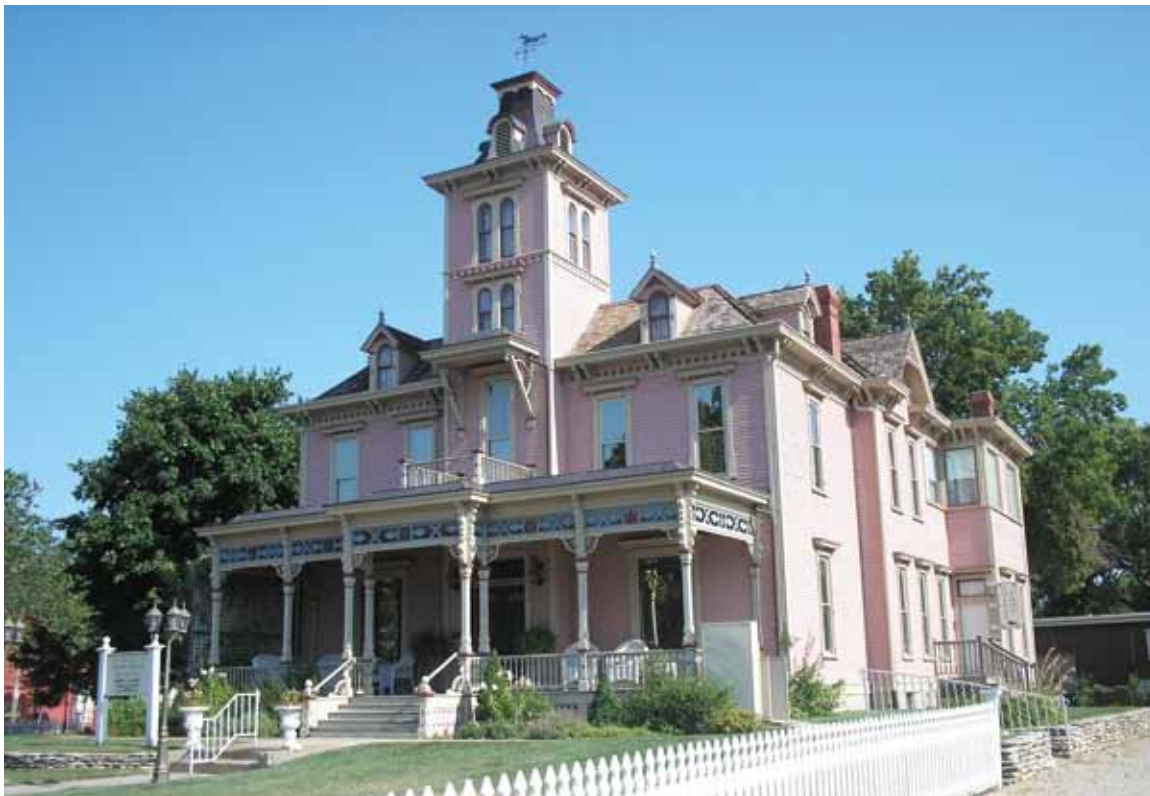
The Kirby House in July 2008.