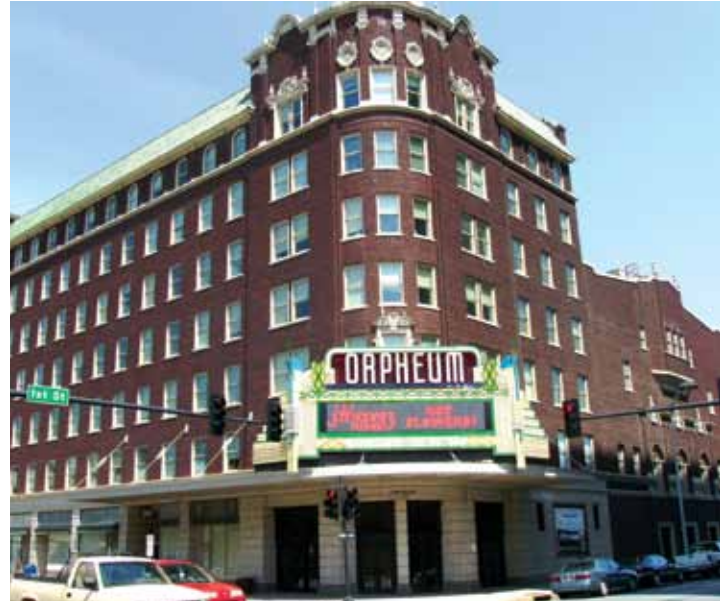
Above, Orpheum Theatre; below, Kansas Aviation Museum, Wichita.

Participants can select from one of two behind-the-scenes tours: