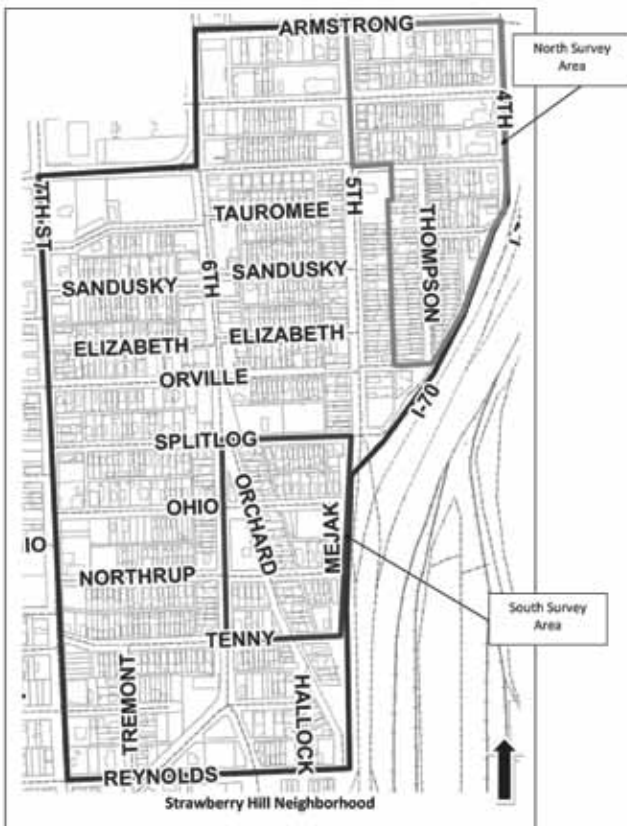
Survey areas within the Strawberry Hill neighborhood.

In 1843 approximately 700 members of the Wyandotte tribe arrived from Ohio and purchased more than 23,000