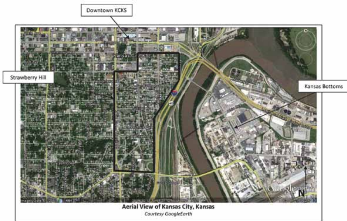
Aerial image of downtown Kansas City and Strawberry Hill.

Strawberry Hill is one of several neighborhoods in Kansas City, Kansas, historically settled by immigrant groups and anchored by culturally-specific Catholic parish churches. A large number of current residents are members of the initial immigrant families that settled in this area, with houses having been passed down through the generations. The densely populated neighborhood has seen few tear-downs and some infill housing, with narrow lots, predominant front porches, and stone retaining walls tying the lots together. The neighborhood's overall design is continually studied by planners and emulated by architects in new housing developments around the country.