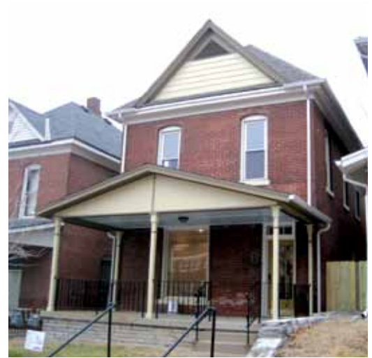
Left to right, St. John the Baptist, 708 N. 4th Street; 713 N. 5th Street; 807 N. 5th Street.

Little new development occurred in Strawberry Hill during the 1920s. The streetscapes having already been largely filled, only 34 buildings in the survey areas date to the period between 1910 and 1929. However, among the few new buildings that went up were the 1927 Holy Family Church and rectory at 274 Orchard Street, as well as the 1925-1927 St. John's Catholic Club and School at 422 Barnett Avenue.