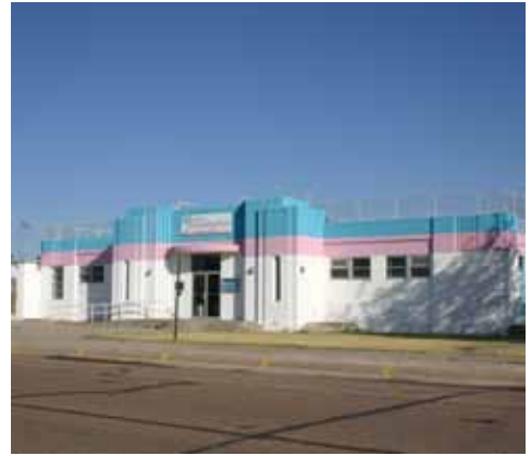
Left to right, Scott Spring on the Oregon-California Trail, Pottawatomie County; Alcove Spring, Marshall County; former Colby Municipal Swimming Pool and Bath House, Thomas County.

near this crossing made it a suitable campground while west-bound travelers waited for high waters to recede. The nominated site contains the location of the spring itself, as well as an intact trail segment that includes at least three distinct swales. This site is nationally significant for its association with the Oregon and California trails and for its potential to yield important archeological information.