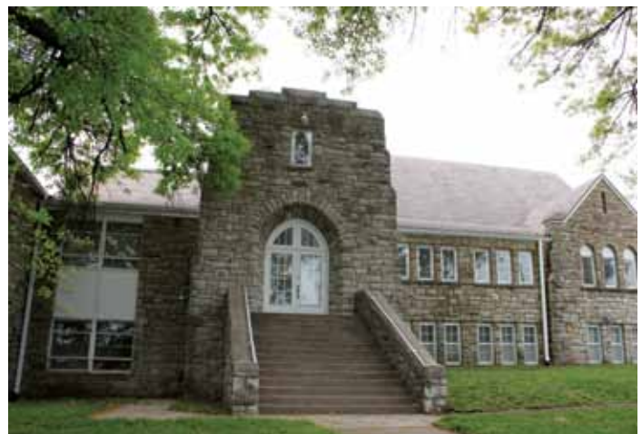
Left to right, Harry Keith Barn, Graham County; Welborn Community Congregational Church, Wyandotte County.