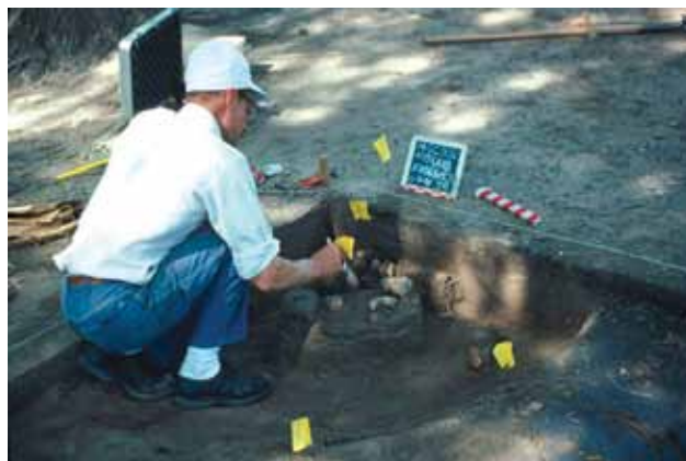
The Kansas Archeology Training Program began 40 years ago at the ancient site of El Cuartelejo in Scott County. Ninety volunteers began that annual tradition that continues today.

Possibly more important is that the program has volunteers who return year after year. These people choose to spend part or all of their summer vacations learning about the past in Kansas and contributing to that body of knowledge. The national award justifies the commitment of these volunteers.