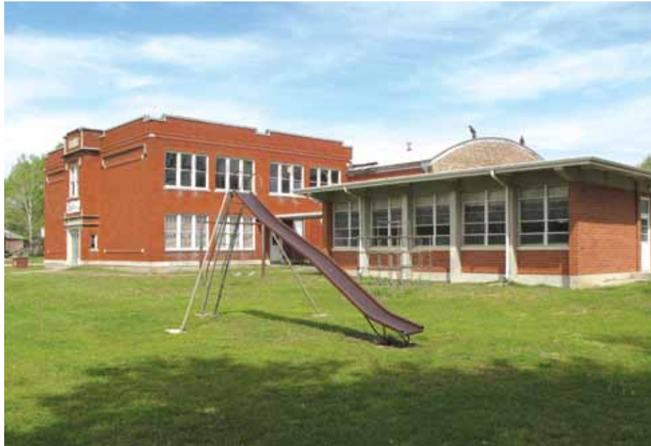
Above, Fulton High School and Grade School, Bourbon County ; below, Evangelical Lutheran School, Lincoln County .

War II air field. The Great Bend Army Air Field Norden Bombsight Storage Vaults, built in 1943, are utilitarian concrete structures also designed by the Corps for the storage and issue of the Norden bombsights during World War II and were part of the national defense strategy in the area. The structures are nominated as part of the World War II-Era Aviation-Related Facilities of Kansas multiple property nomination for its statewide military significance.