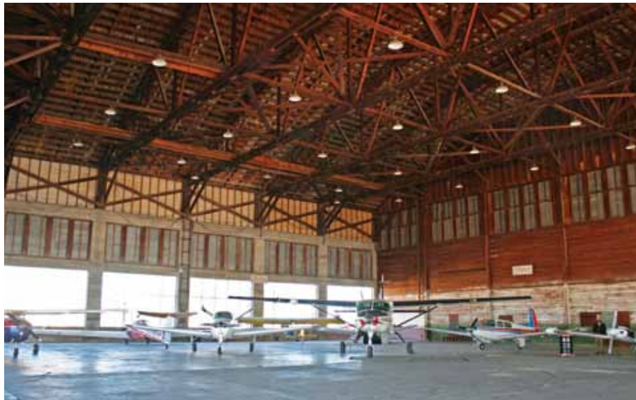
Above, Great Bend air field hangar, Barton County; Below, Great Bend Norden Bombsight Storage Vaults, Barton County.