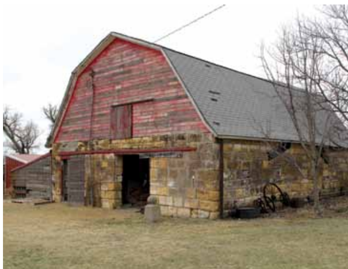
Papes Barn, Ellis County.

National Register of Historic Places: nps.gov/nr Kansas Historical Society (National and state registers): kshs.org/14638