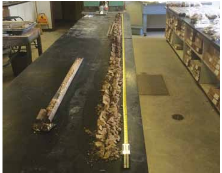
Left, a small arrow point, the size and shape indicate it is 900 to 1,500 years old. Right, a 20-foot-deep soil core taken from the Kraus site by Dr. Rolfe Mandel.

Dr. Rolfe Mandel of the University of Kansas, tell us about the nature and speed of sediment deposition or erosion on the site landscape, which is a function of climate and vegetation. Analysis of the stable isotope levels from the core, another indication of temperature and rainfall, are underway. Finally, remains of seeds, teased out of soil samples by submerging them in water and allowing the lighter seeds to float and be collected, can reveal what plants were growing in the area and possibly if people were gathering or even growing certain species.