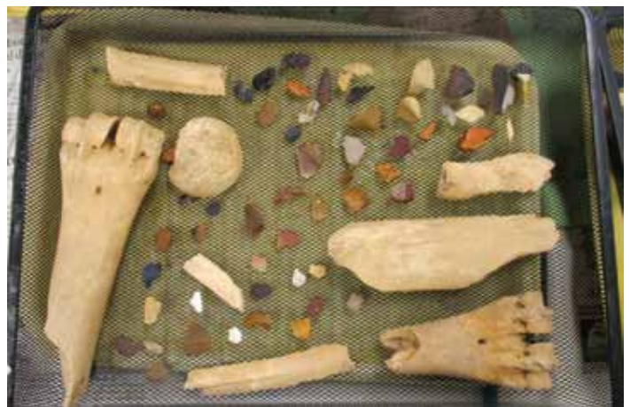
The site produced large amounts of bison bone, debris from manufacturing stone tools, and arrow points.

important. The snails, smaller than a 10th of an inch, tell us about rainfall and temperature. Snails are very picky about where they live and very sensitive to moisture, temperature, and vegetation. The types and numbers of these snails provide clues about climate during the Keith phase. Freshwater mussel shells, abundant at the site, reveal whether nearby Big Creek was deep or shallow, fast or slow, and muddy or clear, which also informs us about the surrounding land and climate. Land animals chosen for food enlighten us about the general environment. Grain size analysis from sections of a soil core, taken by