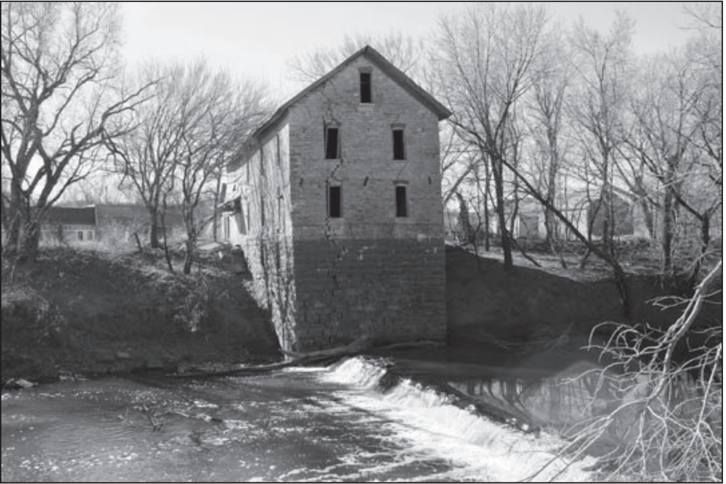
Located along the Cottonwood River, the Cedar Point Mill (also known as the Drinkwater and Schriver Mill) was completed in 1875.