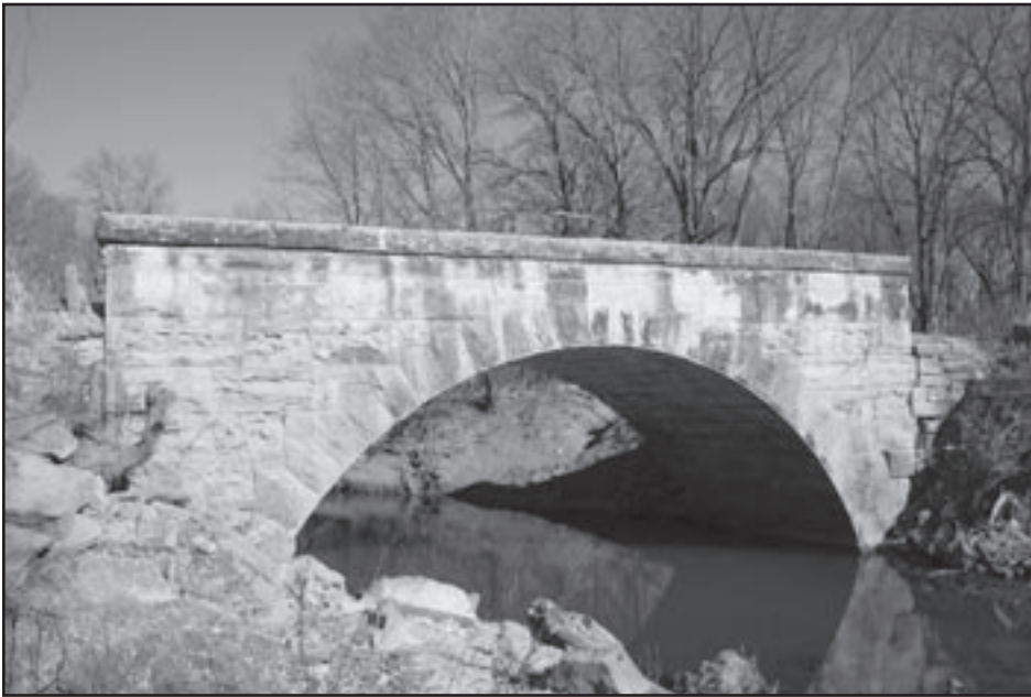
Fox Creek Bridge is virtually unaltered since its construction in 1898.

of buildings located on West Ninth, West Tenth, West Eleventh, East Eleventh, and East Twelfth Streets. The district is primarily composed of brick and stone, one- and two-part commercial blocks designed in the Commercial style. The district is nominated as an outstanding collection of buildings that depict the commercial development of a western Kansas town.