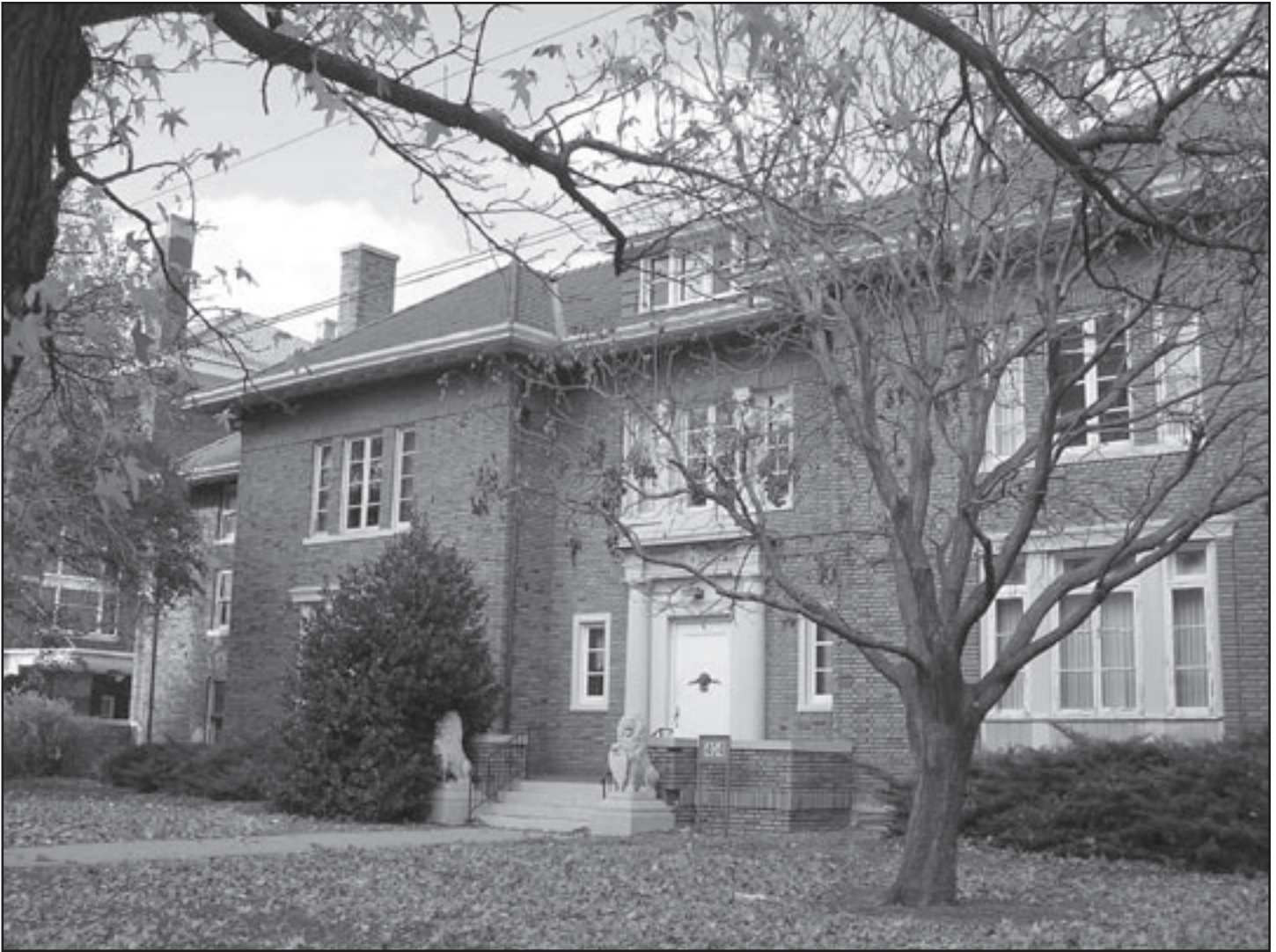
The Dillon House is one of the last remaining important architectural structures from the pre-World War I time period of Topeka.

stone basket capitals flank the entrance. Currently vacant, the building is nominated as an excellent example of Richardsonian Romanesque architecture.