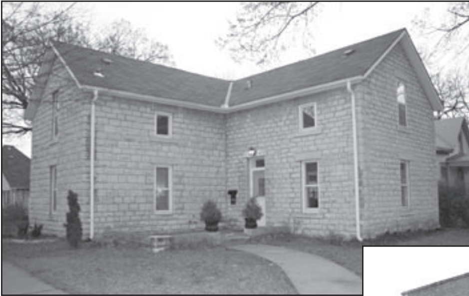
(Above) The City of Manhattan is preparing a multiple property submission of unique native limestone houses, such as the home shown here.