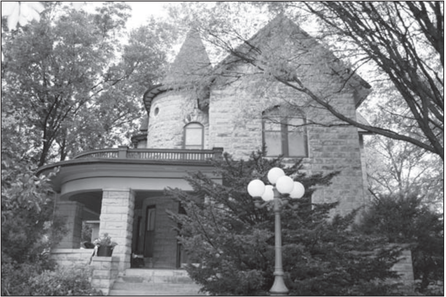
Located in an El Dorado residential neighborhood, the Oldham House is nominated to the National Register as an unusual vernacular example of Queen Anne style architecture.

manufacturing, processing, wholesale distribution, and warehouse buildings. The structures range from one to four stories in height and date from the early 1880s through the 1920s. The district includes five contributing buildings, two contributing structures, one contributing site, and three non-contributing buildings. The district is nominated for its historical association with the commercial/industrial development of Lawrence.