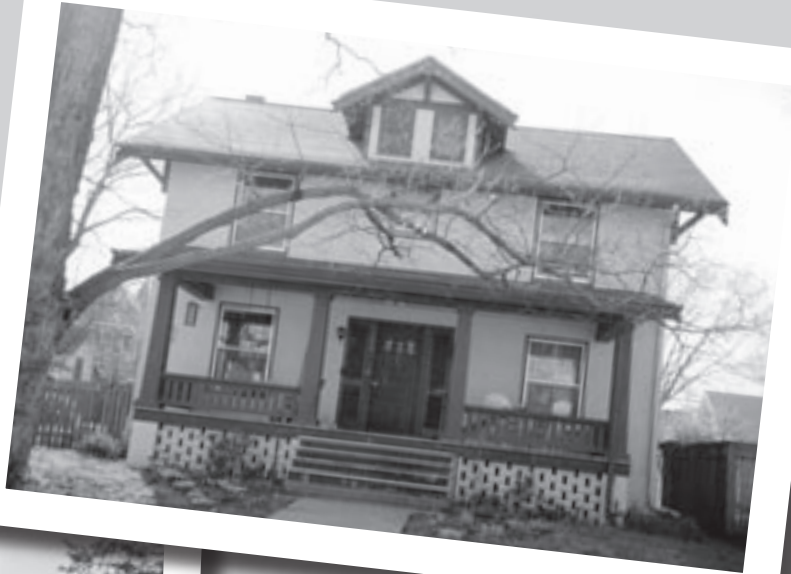
The owners of the Grant Telegraph Building in Wichita (left) utilized federal tax credits for its rehabilitation. State tax credits were used for improvements to the Sunnyland Bed and Breakfast in Garden City (center) and a private residence in Lawrence (above).