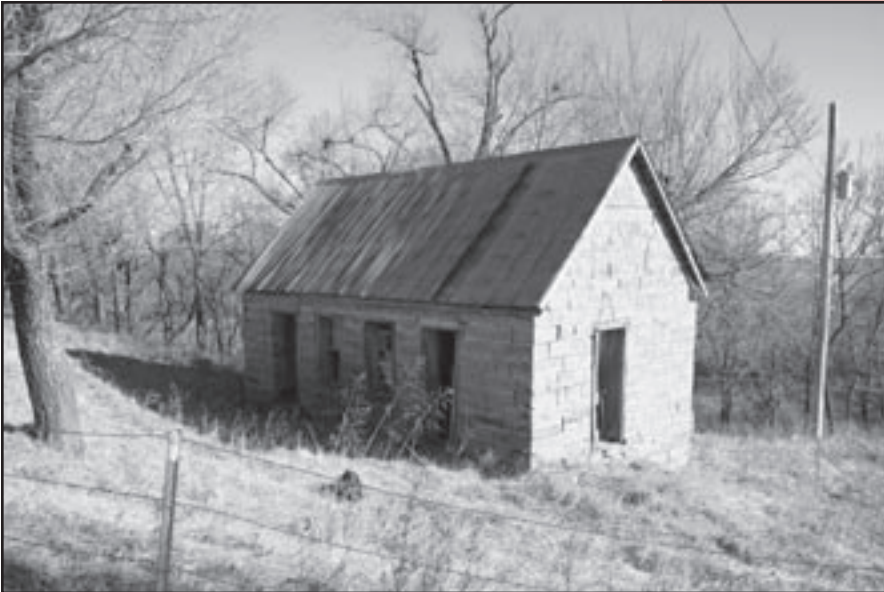
The Welch House near Lafontaine was constructed in 1869 of native limestone.

the castle genre of architecture. It is significant as a vernacular adaptation of elements of medieval architecture and American revival styles that have their antecedents in medieval building design.