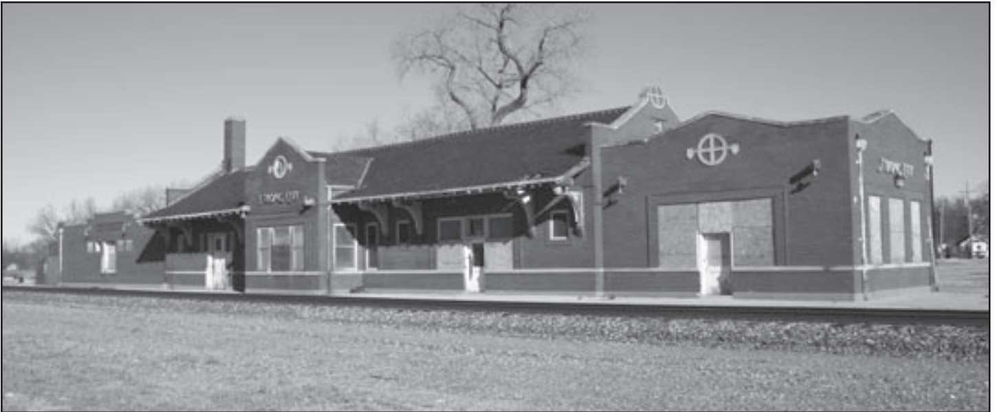
The Strong City Atchison, Topeka & Santa Fe Depot served both railway passengers and freight customers.