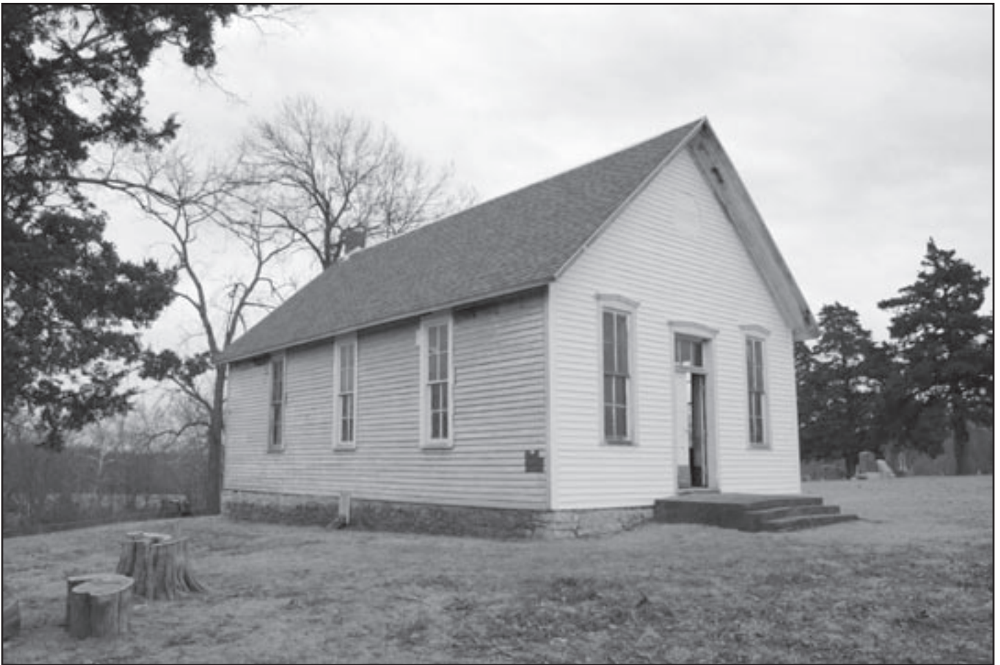
Stony Point Evangelical Lutheran Church is nominated for its association with the development of the Stony Point community and for its architectural significance.

the total width of the bridge deck is 20 feet. The Fox Creek Stone Arch Bridge is nominated as part of the Masonry Arch Bridges of Kansas multiple property nomination for its architectural significance as a limestone, single arch bridge.