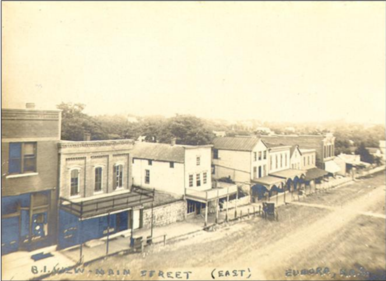
Figure 1. Undated photograph of Eudora's Main Street with 720-722 Main.